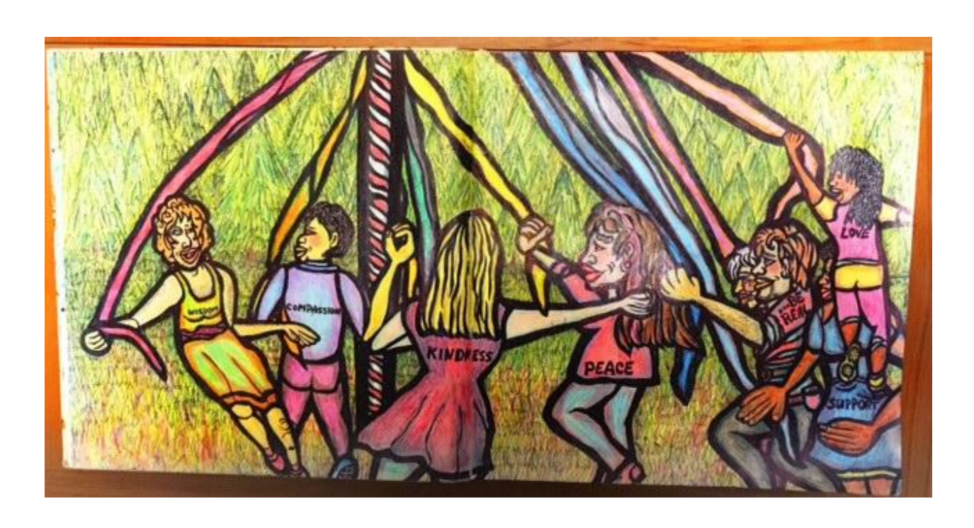
Original Artwork by Amaroq