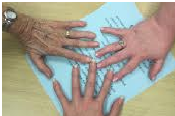
Tarpon Springs, Florida ASCA Group

Unable to see parts of this newsletter? Click here for a web based version