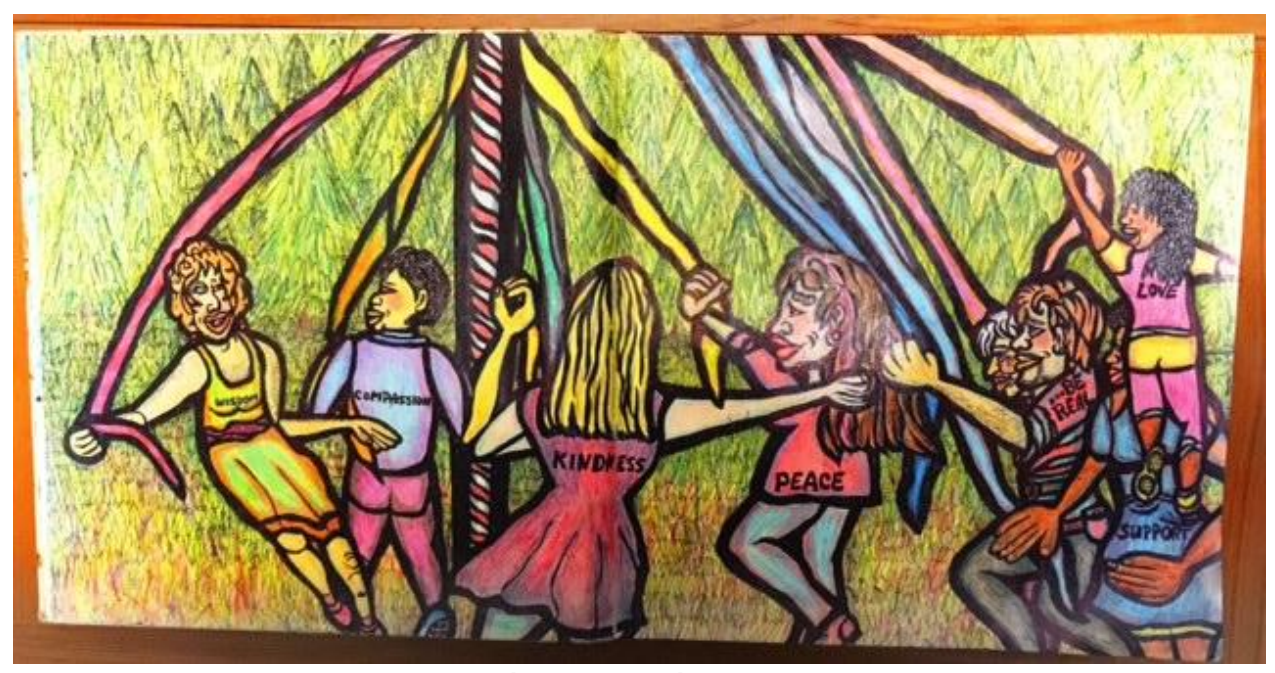
*Original Artwork, June 2018