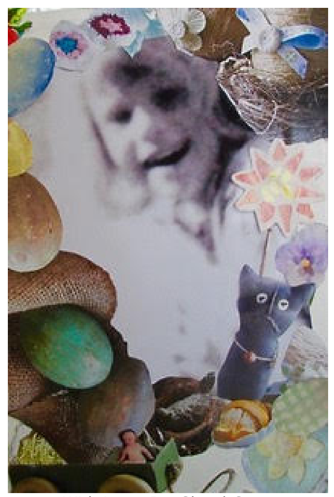
With Love, Ivy Shawl-Song