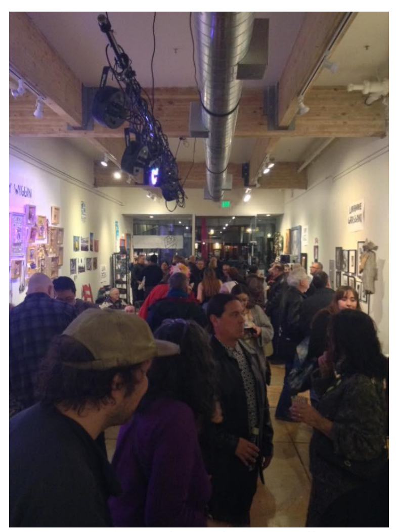
Tons of people in the art gallery