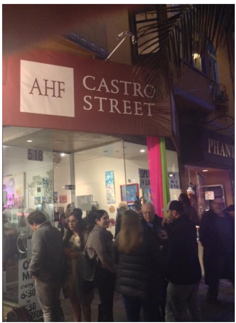
The Art Gallery featuring Amaroq's artwork, literally overflowing with people.