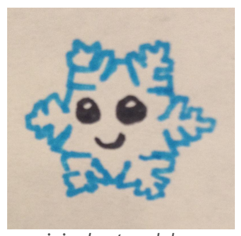
original artwork by an Adult Survivor of Child Abuse