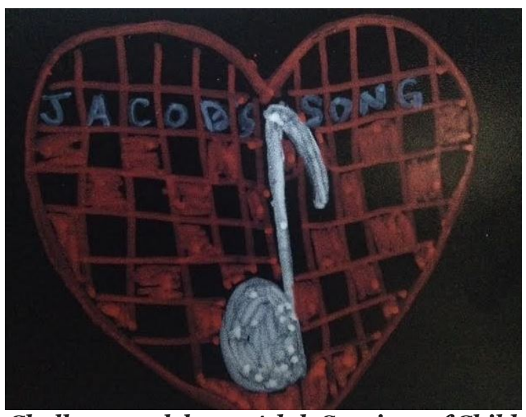
Chalk artwork by an Adult Survivor of Child Abuse in California

G C We might be old and grey G C But we come for justice today G C D The mans gotta listen to what we've got to say